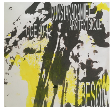
fieldstudy - exhibition in Agger