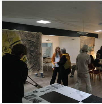
fieldstudy - exhibition in Agger