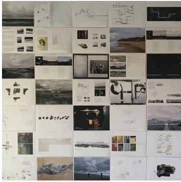
fieldstudy - exhibition in Agger