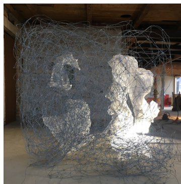
fieldstudy - exhibition in Agger