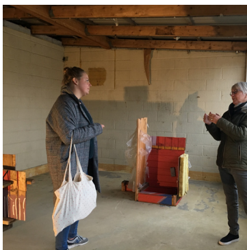
fieldstudy - exhibition in Agger