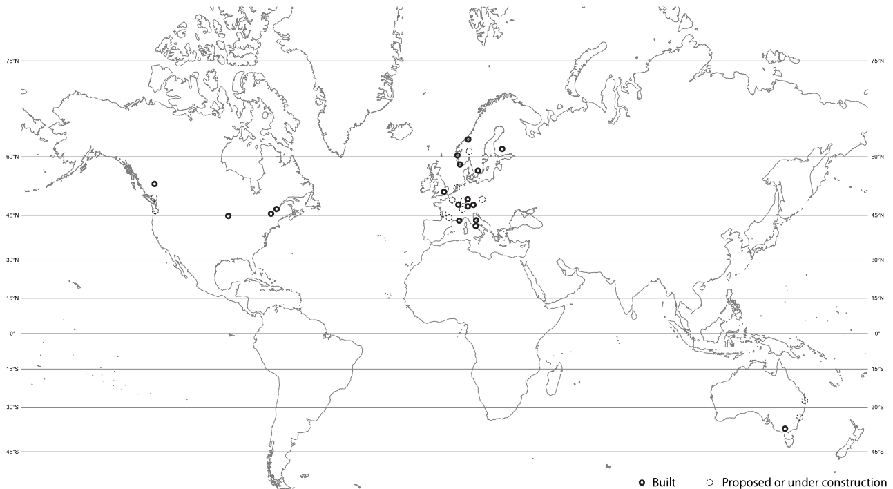
Figure 1: Global distribution of case studies.

not concerned with this type of construction. While the definition of ‘tall’ in the context of timber structures is arguable [6], this study has adopted the Wood Solutions Technical Design Guide’s definition of mass timber high-rise, which includes any building with an effective height of 25 meters or more above the ground line, or, where this information is not available, buildings of 8 storeys or more. [7] This height limitation is the current maximum allowable height for ‘Deemed to Satisfy’ solutions for mass timber construction in Australia as specified by the National Construction Code. This paper is chiefly interested in contemporary timber construction techniques, and therefore only considers projects which have been built in the last decade – the era of tall timber construction ushered in by the development of engineered timber products.