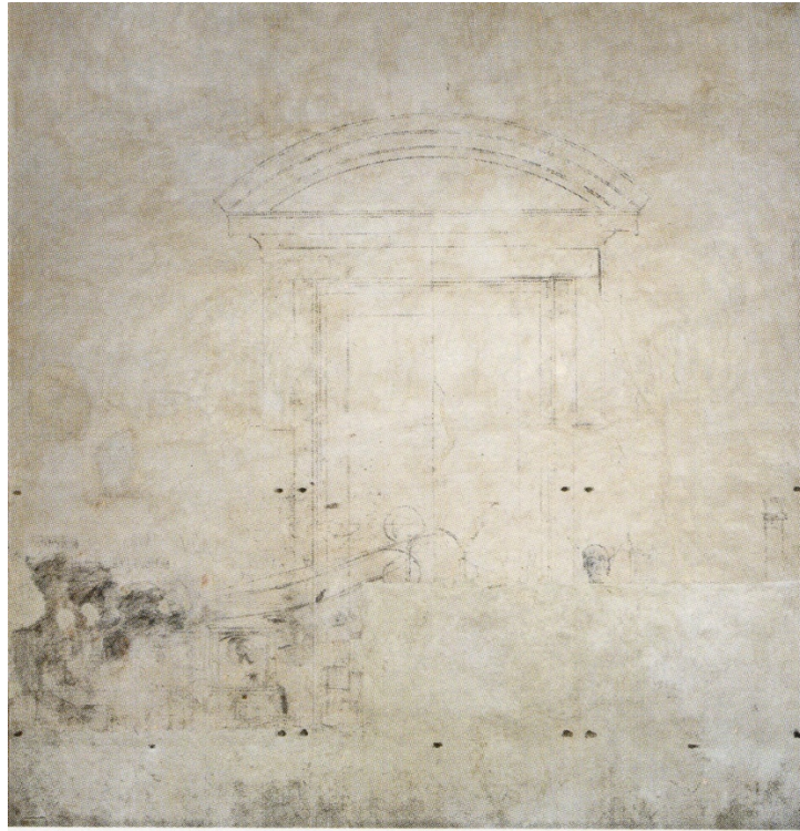
Michelangelo, wall drawing at San Lorenzo, New Sacristy, right side wall