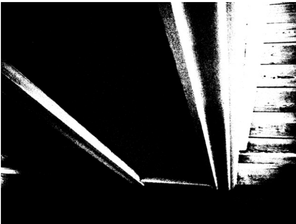
Fig. 1 and 2: Examples of form and light working together, the light being located in the room. In this case, the amount of light is not important in its physical form (Lux) but in its “perceived form” (candela/sqm). Before “the revolution of light”, a candle could easily light up these passageways because they were shaped to our perception. But today even the exceeding use of artificial light can’t prevent elderly people from tripping on a staircase with no perceptual form (top: Stairway and bottom: Doorway)