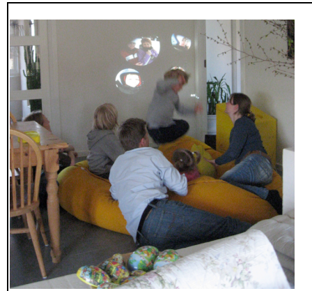
Figure 7. The ‘chair’ and displays of pictures on the wall.

The possibilities to embed sensor and actuator technologies in the physical environment and in this way design interactive spaces and furniture, open up for new challenges and possibilities to design for shared experiences among collocated people. It supports