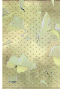
Digital simulation for the textile panel depicting the working-man