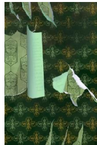
Digital simulation for the textile panel depicting the nobleman