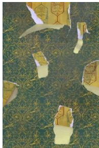
Digital simulation for the textile panel depicting the wallpaper designer