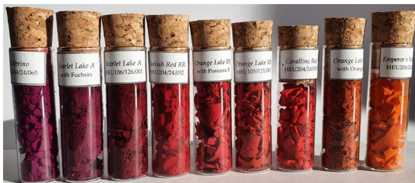
Figure 1: The nine red-orange lakes object of this study.

Reference paint layers were prepared, and their ageing and possible fading was monitored for six months by analysing two sets of paint model systems by colorimetry. One was exposed to indoor natural light, while the other was subjected to accelerated ageing in a Solar box. The composition in terms of organic colouring components and possible photo-degradation products was assessed by High Performance Liquid Chromatography with Diode Array UV-Vis (DAD), Fluorescence (FD), and High Resolution Mass Spectrometry (LC-HRMS) detection. The kinetics of fading of the different lakes were evaluated, and preliminary results on the stability of the formulations will be presented herein.