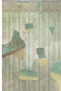
Digital simulation for the textile panel depicting the doctor