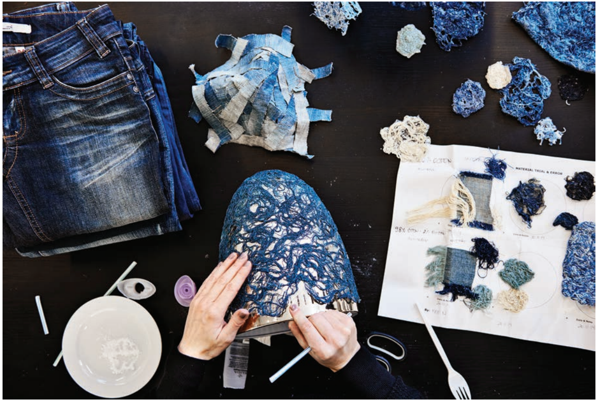
Fig. 1. Samples from a material exploration of the fabric from jeans, in which it proves difficult to achieve material circularity as the fabric is a mix of natural and synthetic fibres (cotton and elastane). (From a pre-trial material driven design experiment in 2014).

which the design process for material driven design for sustainability is tested. Schön writes about reflective research and reflection-in-action as a way to reflect on findings and decide on subsequent actions (Schön 2017). The work reported here can be understood in such terms as well and will be described in greater detail below.