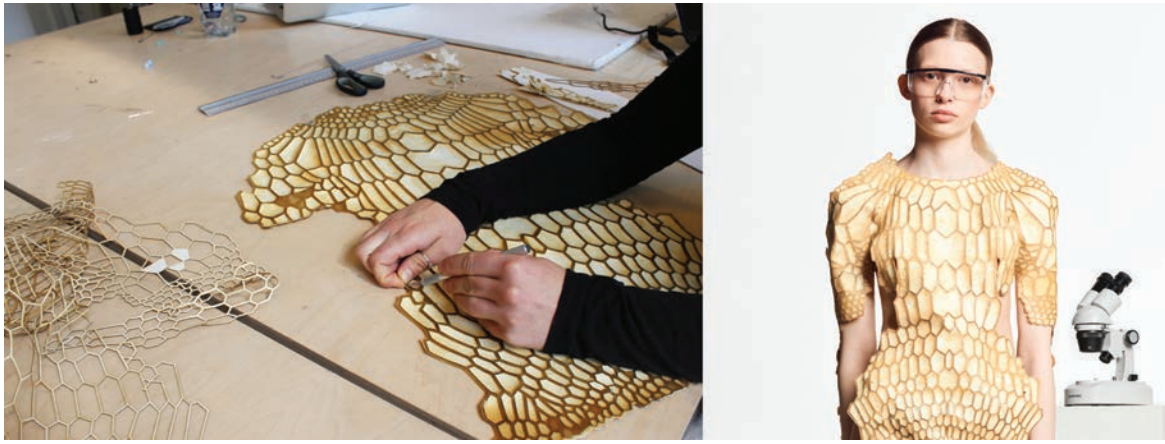
Fig. 8. Image of the process and the final prototype. This project was based on studies of the properties of snake skin and how to grow it artificially. Despite this having a strong connection to natural science, the project ended up far from natural science in the field map simply because the participant did not have the means or facilities to explore the potential for growing this type of material. As a result, the project ended up in what might be deemed a thought-provoking statement, but not strictly a result of a material driven design for sustainability. (Trial 4)

material driven design when studying material composition and structure is primary and large-scale form is secondary. The approach was tested and included from trial 3 with the help of The Biomimicry (The Biomimicry Institute 2018) and a biologist. Amongst other activities, this resulted in field trips to study plants (Fig. 7) (See table 2, D6 – D10).