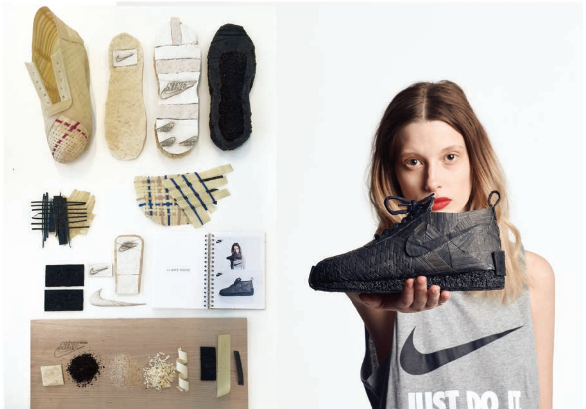
Fig. 2. Image of the process and the final prototype. This participant worked with wood processed as fibres and shavings and mixed with natural rubber. The materials created show excellent properties and received very positive feedback from the designers in the collaborating company. However, the material would need to be developed further to be durable enough for a shoe. Also, because of this apparent incompatibility between material and the functionality of the product, the shoe decreases the perceived value of the material to some degree. (Trial 4)