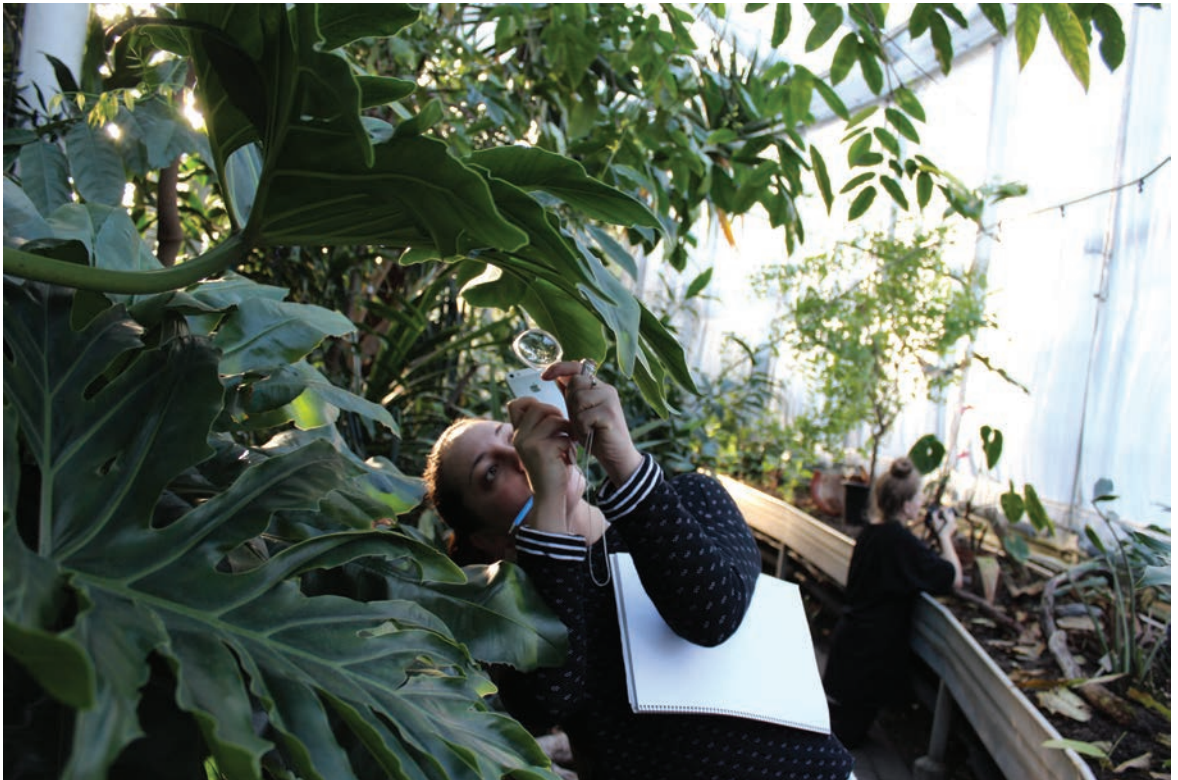
Fig. 7. Participant exploring plant textures, structures and strategies for survival at the botanical garden in Copenhagen. (Trial 3)

ple, if the biodegradability of a material is an important feature for the product, how can this be tested and improved by adjusting the chemical composition? Or, if the tensile strength is vital for the function of the product, how will different lengths of fibres and the ratio between binders and the fibres affect the result?