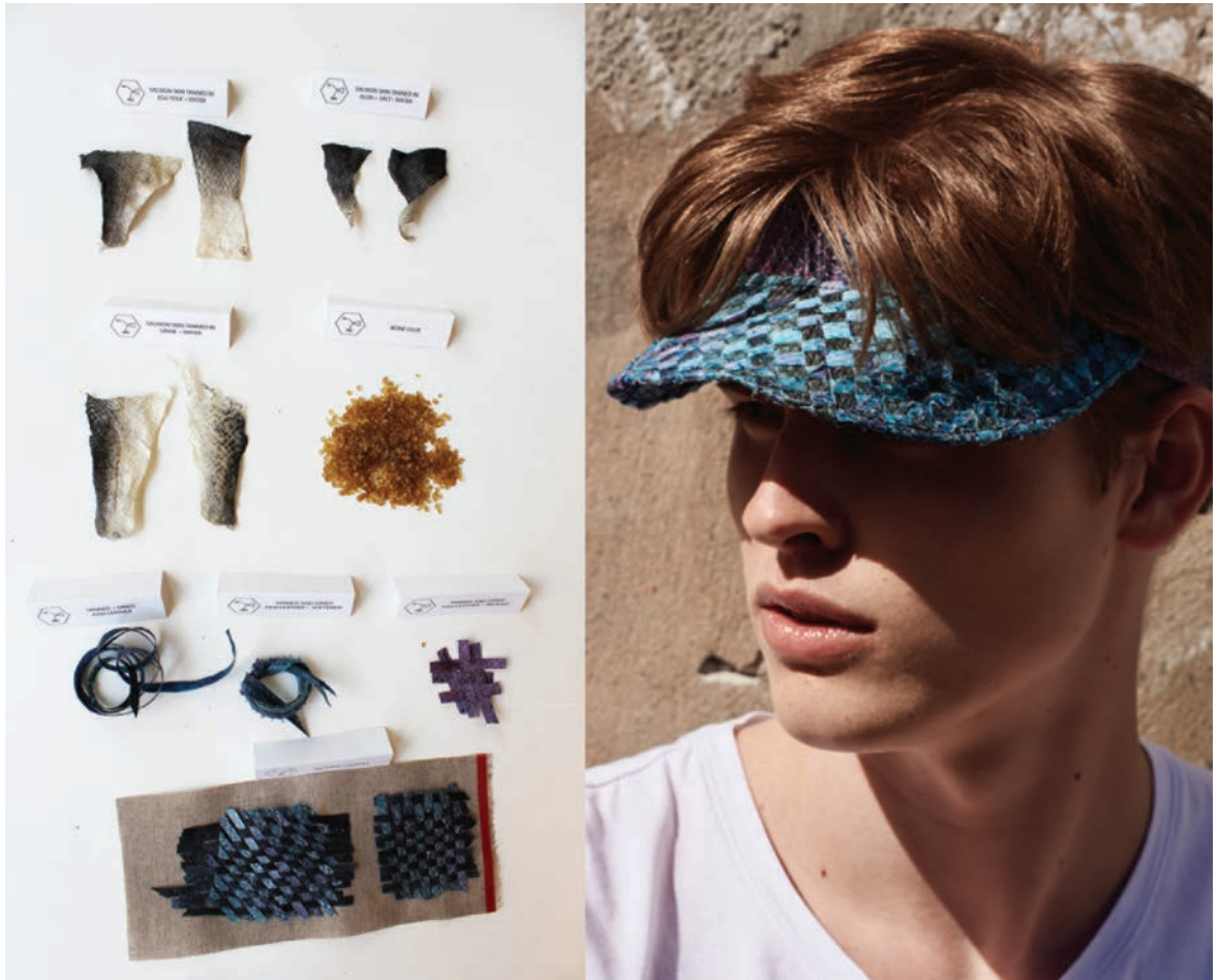
Fig. 9. Samples from the process and final prototype made from salmon skin, a waste product from the fishing industry. The skin has been tanned with urea (from urine) and dyed with natural dyes. The result is a fully biodegradable cap made for Nike. (Trial 4)