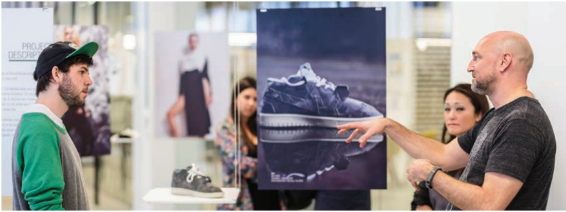
Fig. 3. Participant presenting his final product, a shoe made from leather scrap, to the expert designers in the collaborating company, Nike. (Trial 2)

Likewise, weight can be an issue for sustainability if transportation over long distances is involved, but it can also be an important feature for the functionality of the product. A larger carbon footprint can be accepted for a spoon made from stainless steel that will last for at least a lifetime than for a spoon made from biodegradable corn starch that is likely to be used for less than an hour then disposed of. The importance of the relationship between material and function is illustrated in the following figure (Fig. 2).