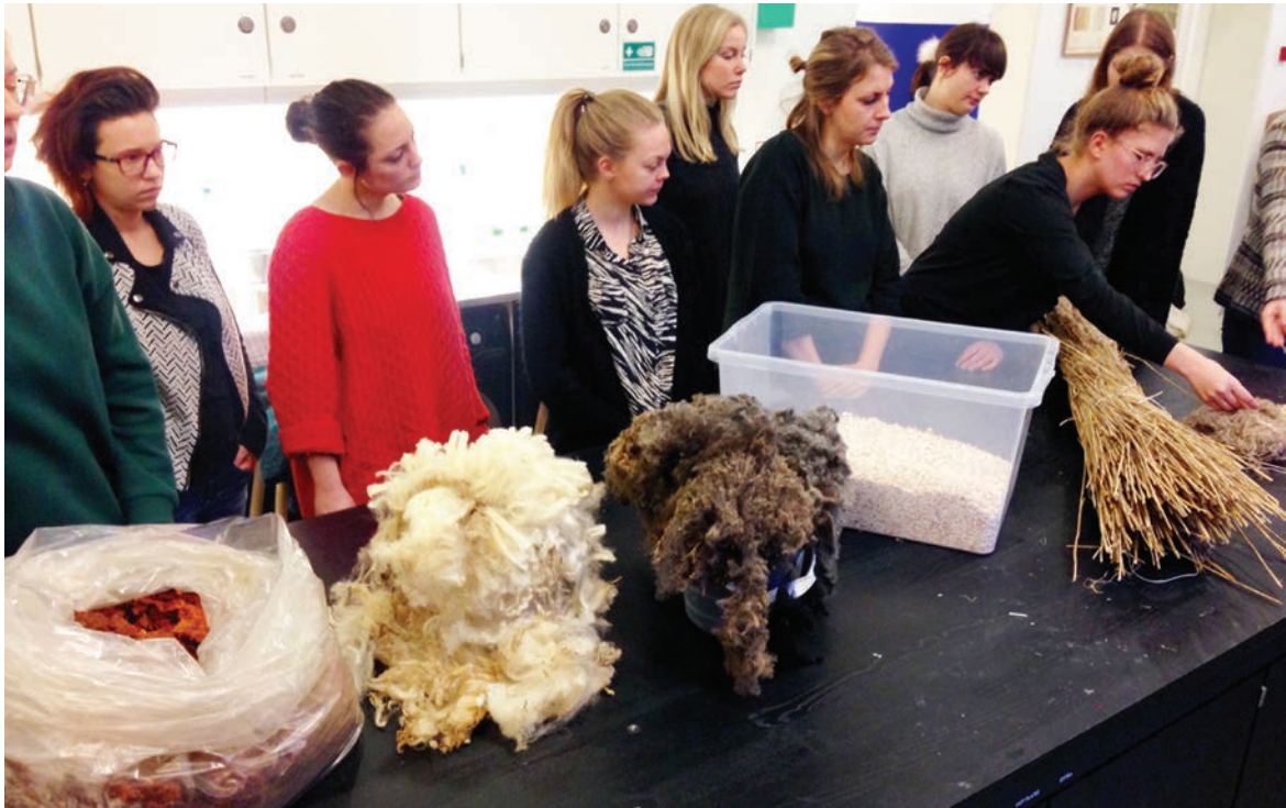
Fig. 5. Participants from trial 3 are being introduced to the raw materials (see table 1 for details).