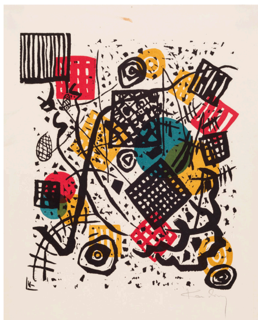
Sheet V. Wassily Kandinsky: Small Worlds V , 1922. Roethel 168. Coloured woodcut. 275 x 235 mm. National Gallery of Denmark, SMK Photo.

Kandinsky articulates the actual picture plane, the graphic ground from which the figurations emerge, in various ways. Particularly in the last part of the series (sheets X–XII), the figures seem to move freely across the plane, which can either be read as something deeper, located behind the figures, or as something occupying the same level as the figures; it is immanent in the paper itself.