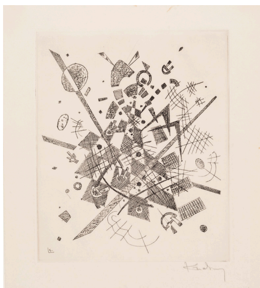
Sheet IX. Wassily Kandinsky: Small Worlds IX , 1922. Roethel 172. Drypoint. 237 x 200 mm. National Gallery of Denmark, SMK Photo.

An image can in itself be described as a microcosm, as its own little world acting through its own ordering principles, including its composition. Thus, we may describe Small Worlds as consisting of individual images that nevertheless have a formal kinship with each other – and in a sense a thematic one too insofar as we see them as