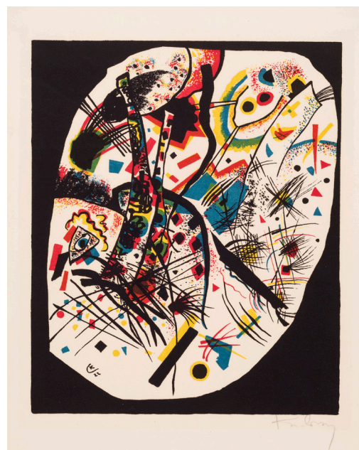
Sheet III. Wassily Kandinsky: Small Worlds III , 1922. Roethel 166. Chromolithograph. 278 x 230 mm. National Gallery of Denmark.