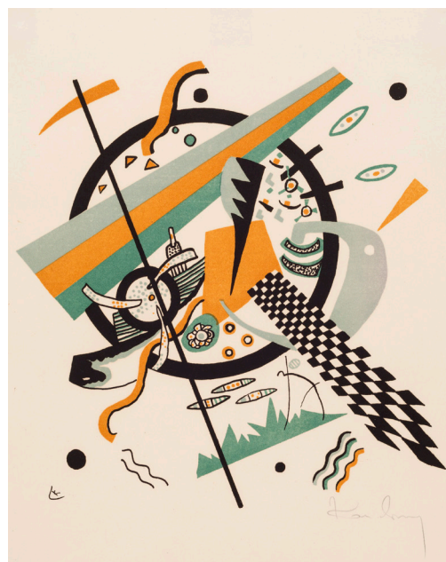
Sheet IV. Wassily Kandinsky: Small Worlds IV , 1922. Roethel 167. Chromolithograph. 267 x 256 mm.