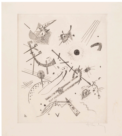
Sheet XI. Wassily Kandinsky: Small Worlds XI , 1922. Roethel 174. Drypoint. 238 x 199 mm. National Gallery of Denmark, SMK Photo.