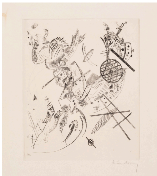
Sheet XII. Wassily Kandinsky: Small Worlds XII , 1922. Roethel 175. Drypoint. 237 x 197 mm. National Gallery of Denmark, SMK Photo.