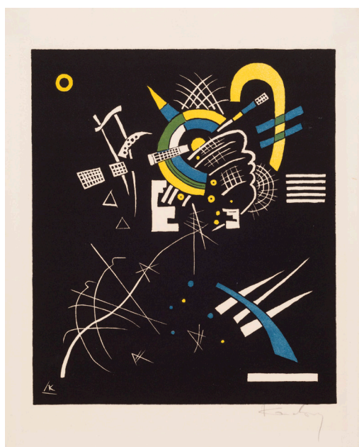
Sheet VII. Wassily Kandinsky: Small Worlds VII , 1922. Roethel 170. Coloured woodcut. 271 x 233 mm. National Gallery of Denmark, SMK Photo.