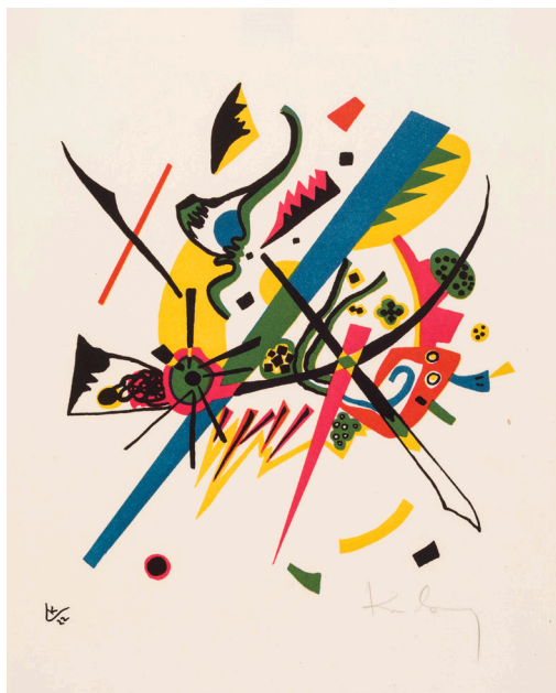
Sheet I. Wassily Kandinsky: Small Worlds I , 1922. Roethel 164. Chromolithograph. 247 x 218 mm. National Gallery of Denmark, SMK Photo.

of his early paintings gradually become reduced to purely pictorial or iconic elements, and also pointing towards their 'pictorial energetics, generated by counter-movements'. 2