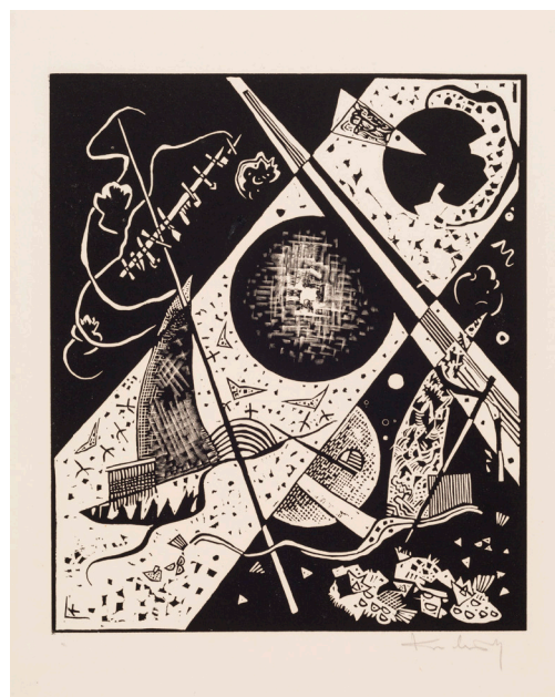
Sheet VI. Wassily Kandinsky: Small Worlds VI , 1922. Roethel 169. Woodcut. 272 x 233 mm. National Gallery of Denmark, SMK Photo.