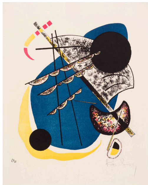
Sheet II. Wassily Kandinsky: Small Worlds II , 1922. Roethel 165. Chromolithograph. 254 x 211 mm. National Gallery of Denmark, SMK Photo.