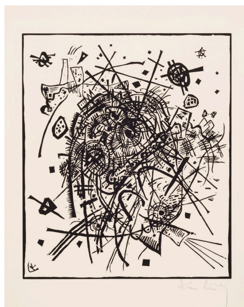
Sheet VIII. Wassily Kandinsky: Small Worlds VIII , 1922. Roethel 171. Woodcut. 273 x 233 mm. National Gallery of Denmark, SMK Photo.