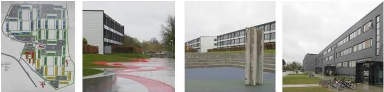
Fig. 3 Langkærparken- layout, Rambla and square, entrance

Langkærparken is nearly twice the size of Gyldenrisparken and does not have a close relation to the dense city but to the suburb with lots of institutions and a mega shopping centre nearby. As seen in table 1. the housing area is almost mono-functional, and new impressions of city relations have been a very important parameter for the design. The scheme is divided into smaller quarters through three different facade materiality's. A Rambla for pedestrians crossing the central car road just where the new appealing and spacious city square is designed has lifted the impression and given the whole plan a central meeting place for several generations.