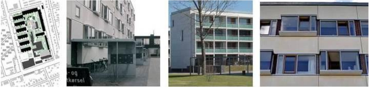
Fig. 2 Gyldenrisparken- layout, entrance and balcony facade, facade close-up

with a housing social effort in the form of a Social Master Plan. The influence of the ghetto list in practice is obvious [20]. The transformation strategy of the blocks tells the story of a concrete panel house, rebuilt in an aesthetic and responsible way from structured panels, repeating the nudges, which are covered by the wrapping. Institutions appear in other materials and create differentiated city spaces and the whole scheme has a very inviting appearance.