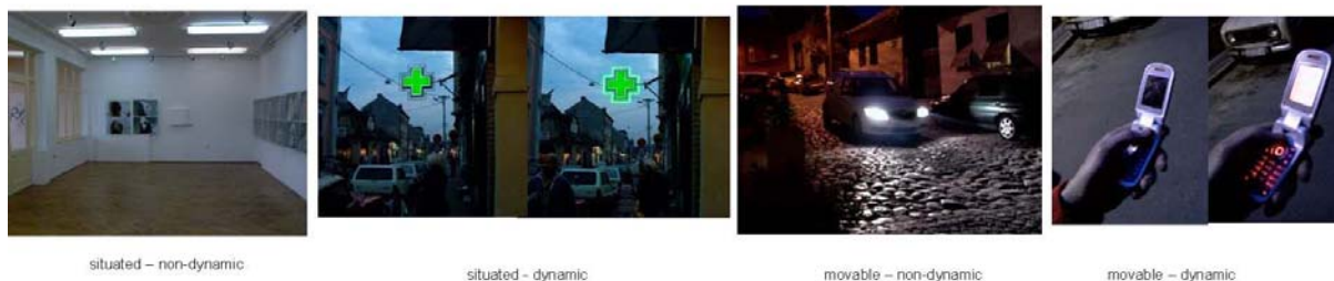
Illustration 2 – (Bülow, K. 2007) Rhythmic qualities

When observing light from light sources, as if they were plants growing in each their individual pace, also light sources have each their own rhythm, expressed as different sequences of rhythmic qualities; when light comes from a light source, whose luminous output is always the same and which is never switched off it has a sequence of non-dynamic quality. When light comes from a source with changing levels, colours or distribution like the changing light from a bill-board or from the simple on and off function in traffic lights, there is a sequence of dynamic quality. What makes the rhythm of light sources even more complex than the rhythm from growing plants is that light sources also have either movable or situated qualities, like the lights from a bicycle or car in motion in contradiction to the stationary street lamp. Even daylight sources have rhythmic qualities, the sky changing colour and intensity, the clouds moving and changing size, intensity and colour, the sun moving slowly through its course over the sky. The really interesting polyrhythmic interplay begin, when the rhythms from daylight sources and electrical sources is observed, each having their very different pace and inevitable doing interaction as the different natural and human controllable light sources they are.