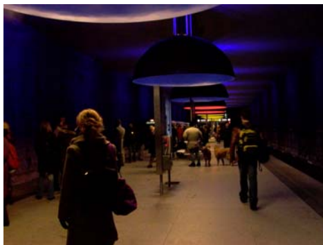
Illustration 3 – (Bülow, 2007) Westfriedhof U-bahnstation

Westfriedhof U-bahnstation in München is one of 100 stations in the München underground system. The system has been extended gradually since 1971 containing many different station designs. Westfriedhof U-bahnstation is characterized by 11 lampshades with a diameter of 3,80 meter coloured on the inside going from blue in one end of the about 100 meter long platform, to red in the middle and yellow in the other end of the platform. The light directed from the lampshades towards the platform creates soft "light-zones" (Madsen, 2005) along the platform through which one moves, moving along the platform. One light rhythm sequence is created as the observer moves through the light-zones of the lamps, which are emphasized by the position under the different colours inside the row of lampshades.