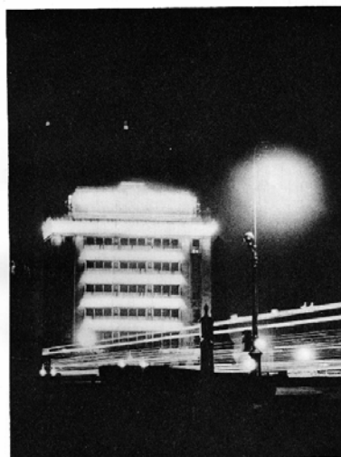
Illustration 1 – (Mendelsohn, 1928) Amerika. Bildesbuch eines Architekten

Already at the beginning at the electrical era, Erich Mendelsohn presented in the book "AMERIKA. Bilderbuch eines Architekten" photos of American cities, and among these nocturnal situations with lights from cars, bill-boards and houses (Mendelsohn, 1928). From the additional text, following the photos, it is clear that the surroundings of the American cities acted somewhat different to the city environment that he knew from home. The photos of Erich Mendelsohn are fascinating, especially because the view of people moving across the cityscape, vehicles driving along the streets, shadows being present from tall buildings and the presence of different kinds of electrical light sources are recognizable from the urban environments of today. The photos of Mendelsohn are of such late date though, that by a closer look a horse and its carriage appear in one photo, the car models are really back to the 1920ies, the spatial structure is much less complex than in many urban environments today - and the amount of moving and dynamic elements are noticeable few compared to the complex and heavy loaded urban topographies of today.