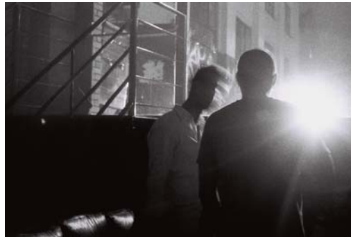
Illustration 4 – (Glasson, 2006) Hoxton Square Bar and Kitchen

In Hoxton Square, in the Shoreditch area of London, the light from car headlights sweeps through the premises of a bar. There are many bars for people to meet after work in, in this area, but this bar, Hoxton Square Bar and Kitchen, is distinguished by a noticeable light rhythm sequence of pauses and strokes made by the light from a car close to a window in the rear end of the premises of the bar, and the pauses in between them. The approaching car, coming directly towards the window, do a turn right in front of the window and leave the observer a bit scattered the first time the phenomena is experienced, especially if intoxicated, since it really seems that the car could go right through the window. When no cars drive down the one-way street towards the window of the bar, the view is a picturesque narrow street surrounded by buildings from the industrial era and lit by spartan pools of light coming from the lamp posts along the street. The electrical lighting in the bar, which seems to have no unnecessary interior decoration whatsoever, is at a low level, which make the experience of the light coming from the car close to the window to be at a very high level. The effect from the light, sweeping through the premises is made even stronger by the fact, that the body is stroke by light from head and down, since the street level is app. 150 cm above the level of the bar premises.