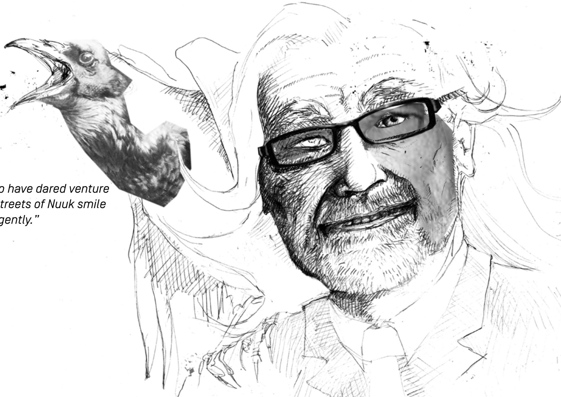
ILLUSTRATION BY JOHN IVERSEN, AARCH

“ Those who have dared venture out in the flooded streets of Nuuk smile to each other indulgently. ”