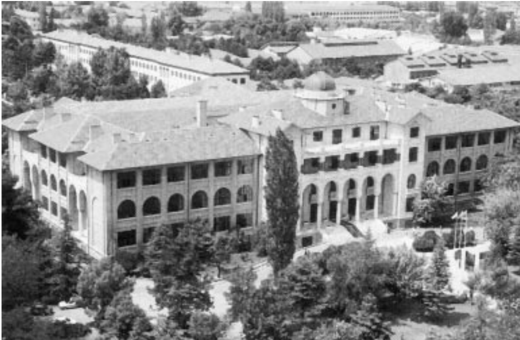
Gazi University, Rector's Building

Gazi University, Faculty of Engineering and Architecture, Department of Architecture, Ankara, Turkey