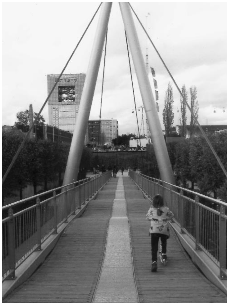
“Barrierfree EXPO 2000, Hannover World Exhibition”.