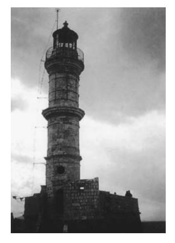
Venetian Lighthouse, Chania

Up till now the debates have been based on personal views and appreciations of the participating Heads or their representatives, giving to the meetings the nature of a valuable exchange of experience. Despite their value, the elimination of spontaneous but not necessarily representative narrations of specific cases or personal views will give way to a more systematic and reliable presentation of the state-of-the-art of the way that schools of architecture in Europe consider the above four topics. The outcome is expected to be a consistent survey of the trends and dynamics which have been formed to date. This outcome alongside the debates that it will stimulate upon